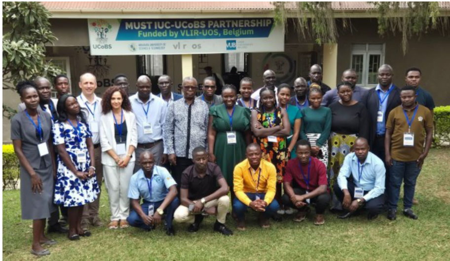
ICTP PHYSICS WITHOUT FRONTIERS UGANDA: East African Training Workshop on Machine Learning and Data Science Applications in Space Weather and Ionospheric Research

(3) ICTP PHYSICS WITHOUT FRONTIERS UGANDA: East African Training Workshop on Machine Learning and Data Science Applications in Space Weather and Ionospheric Research, Mbarara University of Science and Technology (MUST), Uganda, September 25-29, 2025 ( https://www.must.ac.ug/event/eastafrican-training-workshop-on-machine-learning-applications-in-space-weather-and-ionospheric-research/ )