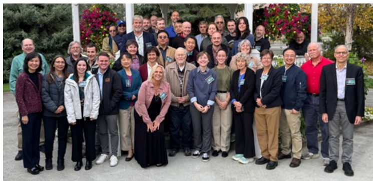
The 2025 Sun-Climate Symposium