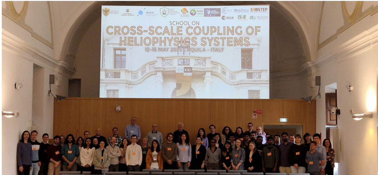
Cross-scale coupling of Heliophysics Systems ( https://www.astrogeofisica.it/cchs )

(1) Cross-scale coupling of Heliophysics Systems, University of L'Aquila, Italy, 12-16 May 2025 ( https://www.astrogeofisica.it/cchs )