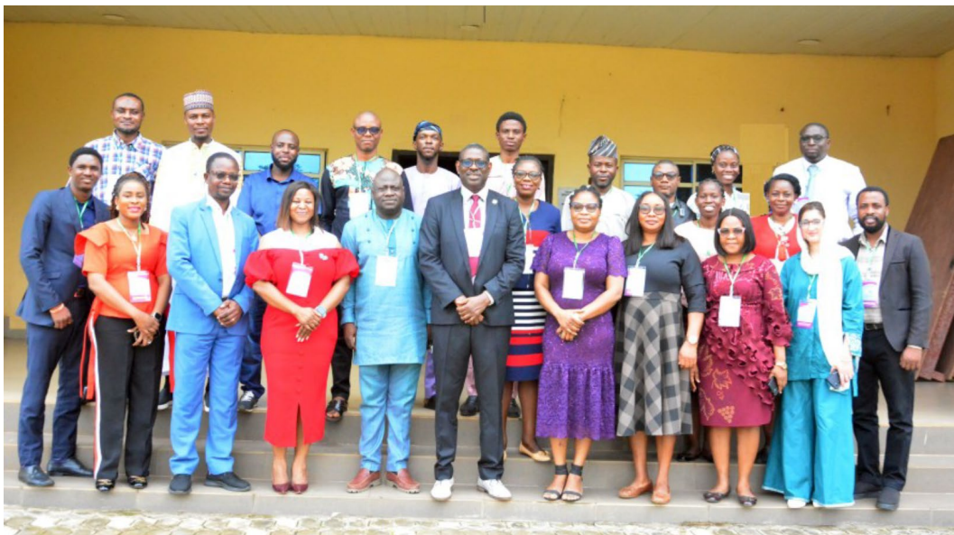
International Colloquium on Equatorial and Low Latitude Ionosphere (ICELLI) 2025

(2) International Colloquium on Equatorial and Low Latitude Ionosphere (ICELLI) 2025, Institute of Space Science and Engineering, African University of Technology, Abuja, Nigeria, September 8-12, 2025 ( https://arcsstee.org.ng/international-colloquium/ )