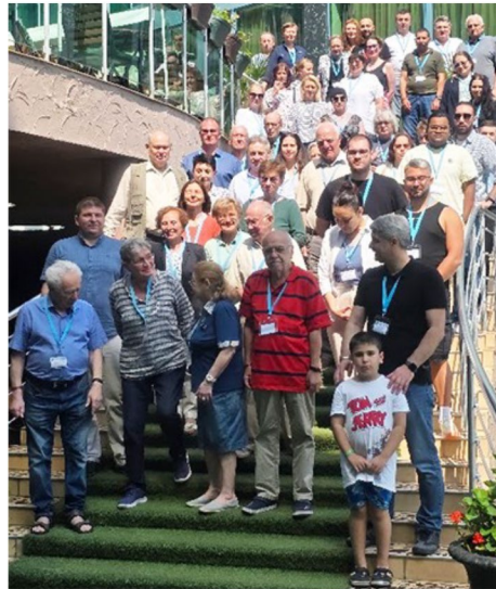
17th Workshop "Solar Influences on the Magnetosphere, Ionosphere and Atmosphere" and Meeting of the Balkan, Black Sea, and Caspian Sea Regional Network for Space Weather Studies