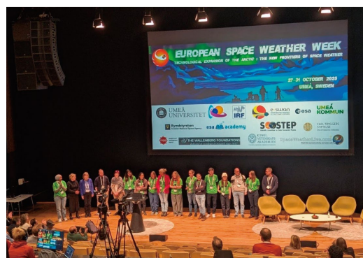
National Organization Committee and volunteers during the closing ceremony of ESWW 2025