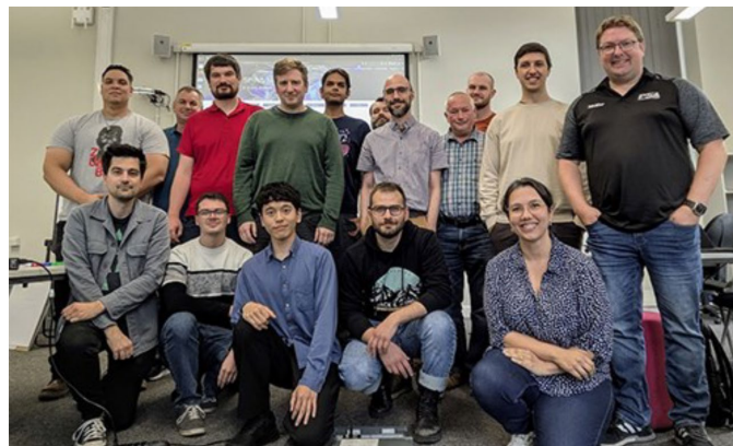
Solar Physics International Network for Swirls (SPINS)