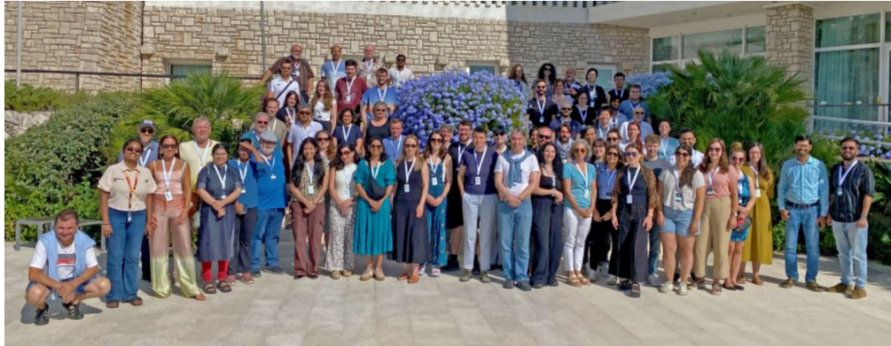
XVIIIth Hvar Astrophysical Colloquium: From the Sun to the Heliosphere and beyond