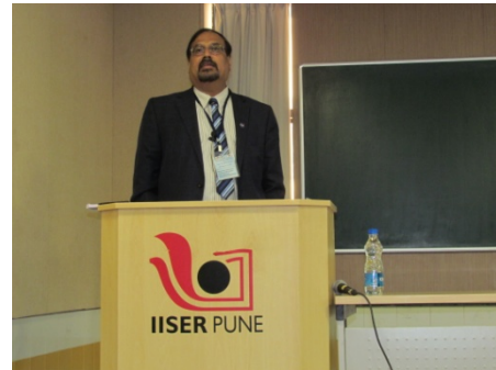
Photo 6: Dr N Gopalswamy, SCOSTEP president and co-chair, SOC, ISSTP 2012, addressing the audience.

The symposium was preceded by a one day tutorial session on Nov 5 2012 for graduate students, where subject experts gave tutorial lectures on areas ranging from magnetic field generation on the Sun to the physics of the Earth's magnetosphere and ionosphere. The 3 subsequent days (Nov 6 - 8) were packed with a mix of invited and contributed lectures from distinguished speakers reporting on a wide variety of research topics related to solar and solar-terrestrial physics. The meeting also featured 80 posters that were displayed throughout the duration of the event.