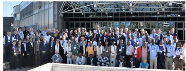
Photo 9: Group photo of the participants in the Chapman Conference in Addis Ababa

High-quality oral and poster papers were presented at the conference. Finally, the conference concluded by formally establishing the African Geophysical Society (AGS), which was officially inaugurated at the closing ceremony of the AGU Chapman Conference. Photo 9 shows the group pictures taken outside the meeting venue.