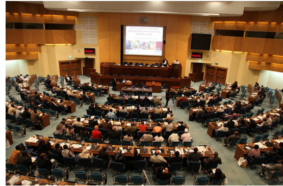
Photo 8: Africa Hall at the United Nations Economic Commission for Africa (UNECA), the venue of the Chapman Conference.

Structure in Total Electron Content and Electrodynamics, (5) Temporal Response to Lower-Atmosphere Disturbances, and (6) Ionospheric Irregularities and Scintillations.