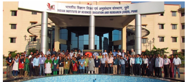
Photo 7: Group photograph of the participants in the ISSTP 2012, Pune.