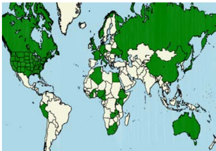
Figure 1: Geographic distribution of countries (shaded in green) that were represented at the Chapman Conference in Addis Ababa

The AGU Chapman conference on longitudinal and hemispheric dependence of space weather, which was the first space weather Chapman conference in the African continent, was held successfully in Addis Ababa, Ethiopia during 12-16 November 2012. The conference organized primarily by Colorado University and Boston College was well attended by a large number of participants from more than 27 nations. Of these delegates about 45% came more 12 African countries, about 35% were from USA and Canada, and the remaining 20% were from other countries around the globe (see Figure 1). The Chapman conference was held at United Nation for Economic Commission of Africa (UN-ECA) meeting hall in Addis Ababa.