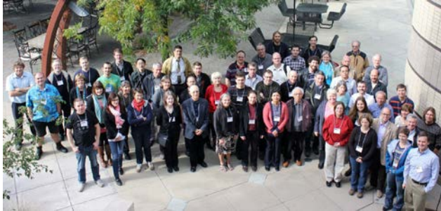
Photo 3: Participants at the HEPPA/SOLARIS-2012 Workshop in Boulder, CO, 9-12 October 2012.

mechanisms that are triggered by either solar irradiance or EPP forcing. With the demise of ENVISAT the community lacks global measurements of the most important atmospheric trace constituents for unraveling the effects of EPP. The investigations of GCR effects are really just in their infancy.