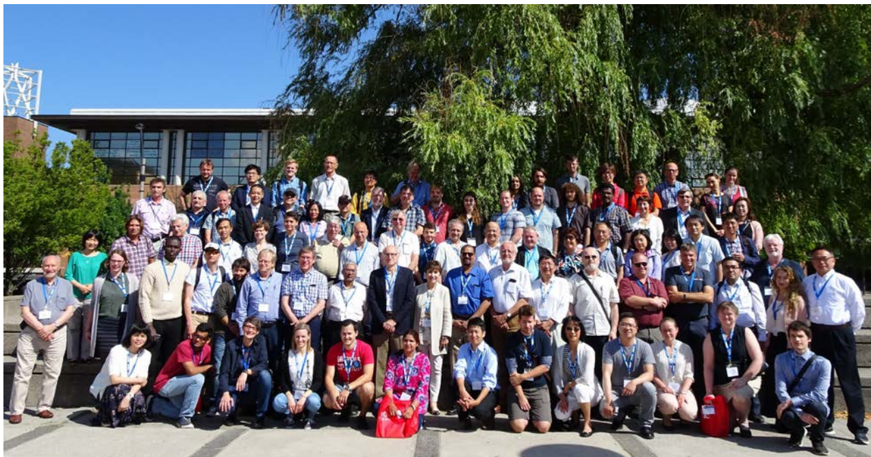
Photo 2. Group photo of some of the participants in STP14

Local organization, including registration and the audio-visual support was carried out with the help of graduate students and Post-Doctoral Fellows from the Lassonde School of Engineering. Attendees varied from distinguished scientists in the field to graduate students. A portion of the registration fee paid by the attendees was made available to support early career scientists and graduate students, thus providing a broad spectrum of experience. The event was widely